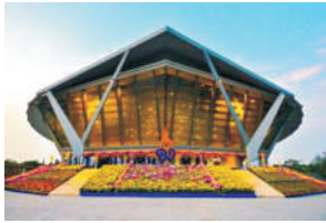
MAHIDOL UNIVERSITY BANGKOK, THAILAND