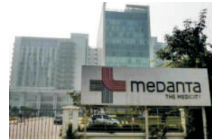
MEDANTA- THE MEDICITY, GURUGRAM