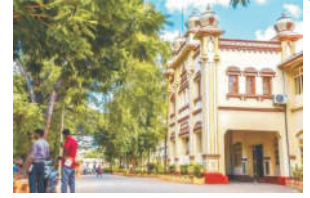
UNIVERSITY OF JAFFNA, SRI LANKA