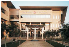
RAK HOSPITAL, DUBAI